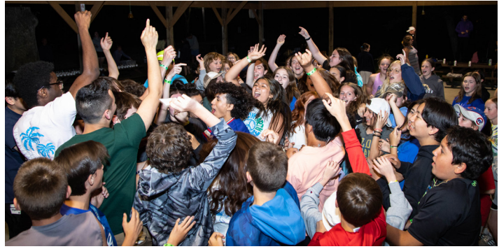
Youth Ministry Summer Camp

with us to an overnight camp in Wisconsin