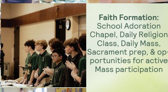
You Belong Here!