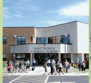
Extra Programming: Orchestra, Band, Choir, Math Team, Student Service Leaders, Chess, Theatre, Academic Decathlon, & Battle of the Books